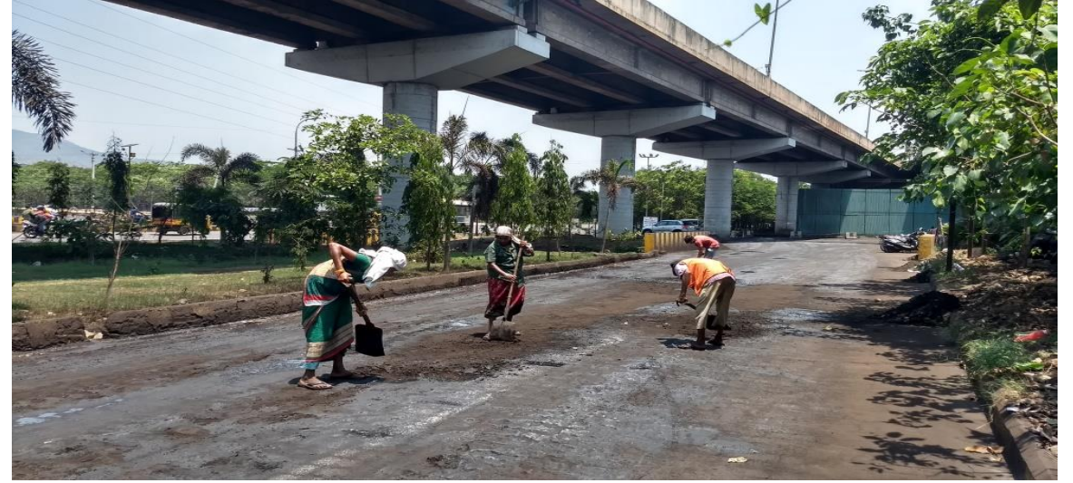
MANUAL SWEEPING OF ROADS