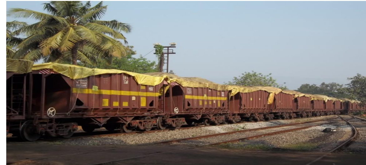
COVERING OF TRUCKS / WAGONS WITH TARPAULINS