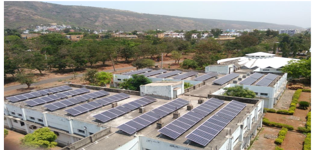
ROOF TOP SOLAR