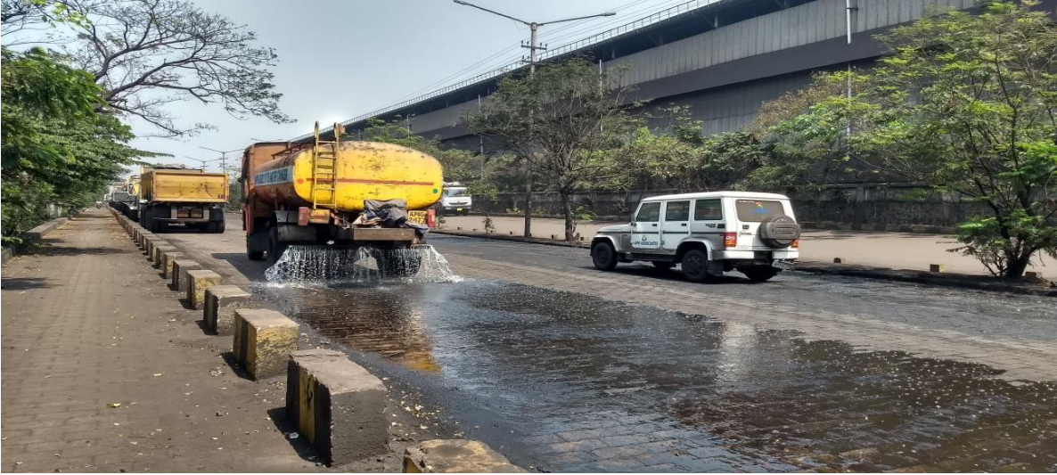
SPRINKLING OF WATER ON ROADS