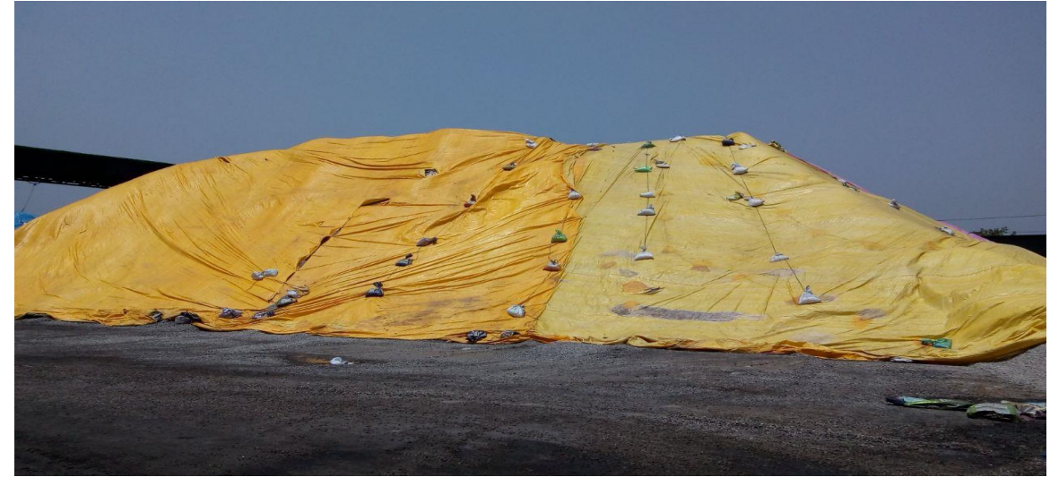
COVERING OF STACKS WITH TARPAULINS