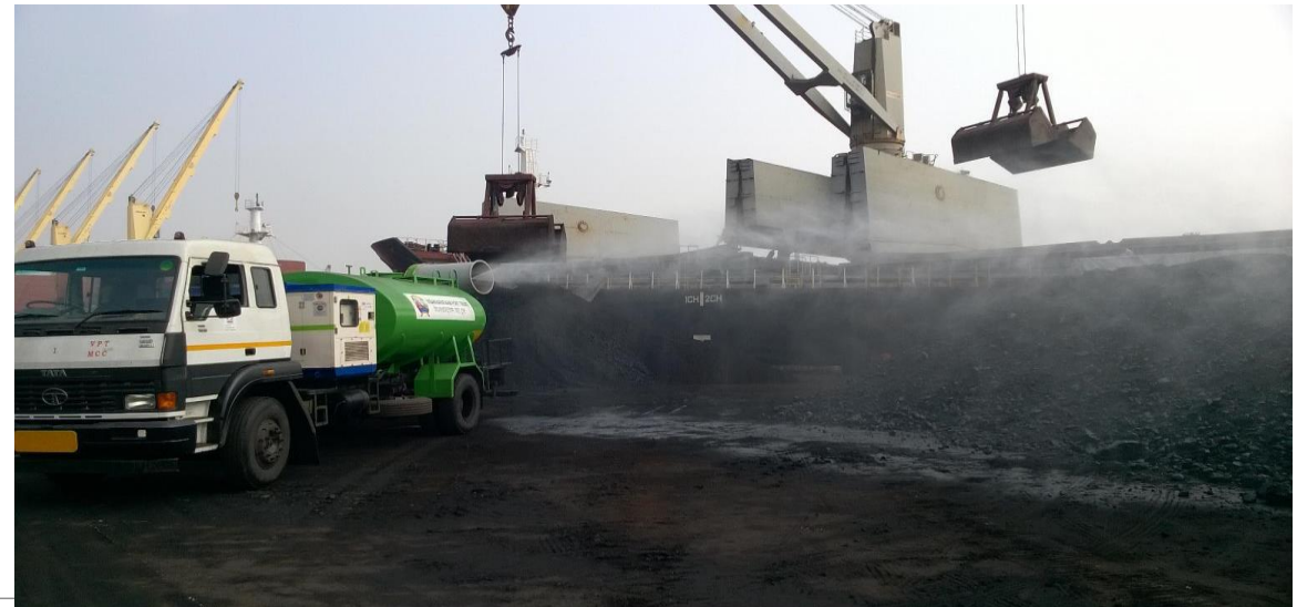
FOG CANONS AT BERTH AREA