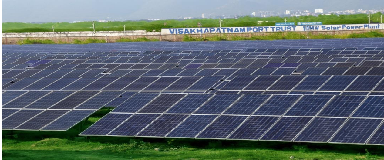
10 MW SOLAR PLANT