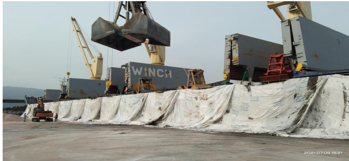
SAVE ALL NET AT BERTH