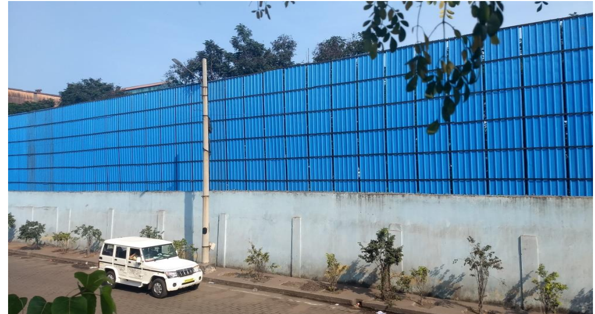
HIGH RISE WALLS AND DUST BARRIERS