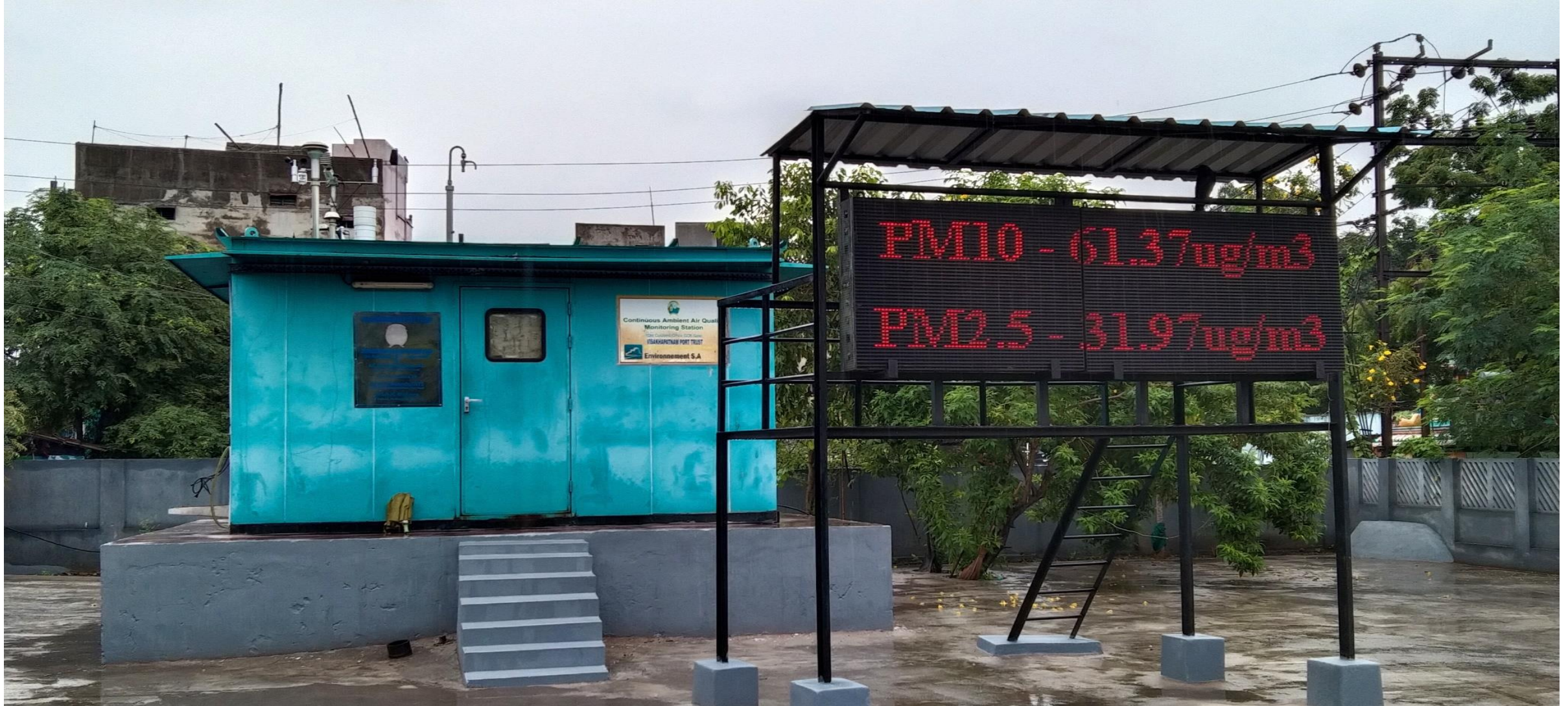
CONTINUOUS AMBIENT AIR QUALITY MONITORING STATIONS