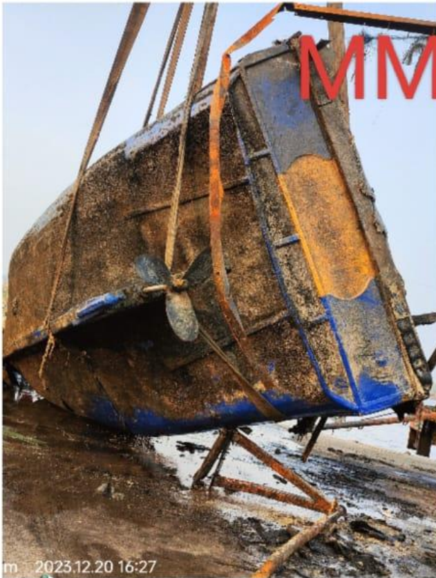
mm 789 m | 2023.12.20 16:27