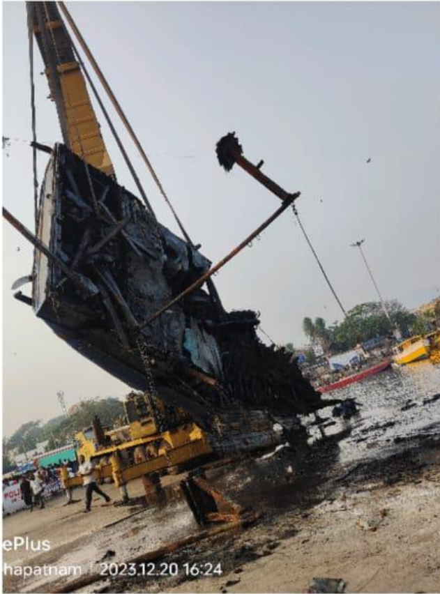
Shot on OnePlus Visakhapatnam | 2023.12.20 16:24