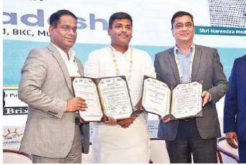
MoUs exchanged by Visakhapatnam Port Authority during the GMIS-2023 held at Mumbai

The three-day international event that concluded on Thursday was inaugurated by Prime Minister Narendra Modi in a virtual mode.